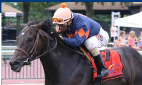
Liz's Cable Girl